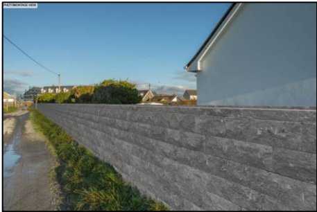
Figure 1: Photomontage of proposed Well Stream u-channel

• Ennistymon Council Office, Ennis Road, Ennistymon, Co. Clare, V95 YX81 The planning application documents will also be available to download from the project website <u>www.kilkeefrs.ie</u>. A link to the An Bord Pleanála online planning portal will also be available.